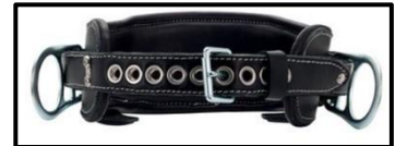
2D Lineman Tongue Buckle Body Belt

As part of 3M Fall Protection's continued commitment to producing high quality safety and personal protective equipment, we conduct periodic testing of our products. Recent testing of specific 3M™DBI-SALA® Delta™ Seat Belt™ 2D & 4D Lineman Belts (see pictures to right) has returned unfavorable test results on some units. These Lineman Belts are certified to a variety of standards but specifically this recall applies to the compliance with the Canadian Standards Association (CSA) Z259.1-05 Section 6.2 and ASTM F887-13. This section requires the belt system to be dynamically tested to ensure the last tongue buckle belt grommet will hold up in a misuse situation or accident involving only one D-ring being connected. In recent internal testing, some of these models did not meet this dynamic test requirement. Because they are marked as meeting the CSA and ASTM F887-13 standards and we experienced the recent non-passing tests, 3M Fall Protection is issuing a recall for specific 2D and 4D models (see part numbers listed below) manufactured between Sept. 19, 2019 and June 30, 2020.