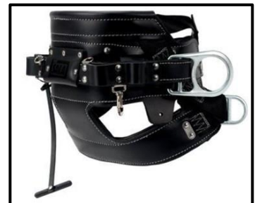
4D Lineman Tongue Buckle Body Belt

Please note: these 3M™ DBI-SALA® 2D & 4D Lineman Belts do meet the test procedures stated in OSHA 1926 Subpart "M", Appendix "D".