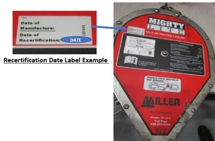
Figure 2: Recertification Label Example