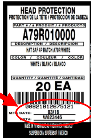
Label with Lot Number

2.) If the hard hats have already been removed from the case, the Lot Number will no longer be identifiable. In that case, look for the manufacturer's date on the underside of the brim.